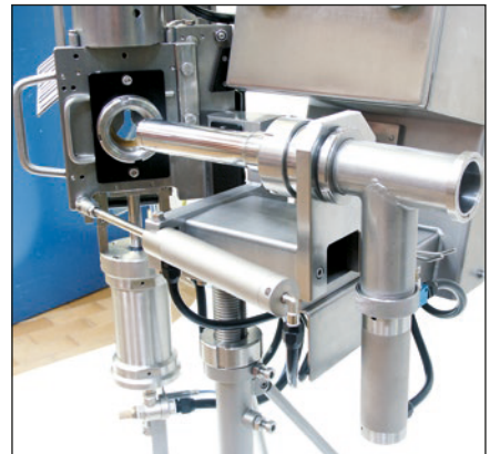
Pneumatic return pump